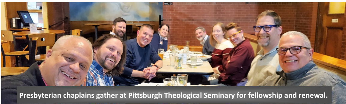
Presbyterian chaplains gather at Pittsburgh Theological Seminary for fellowship and renewal.