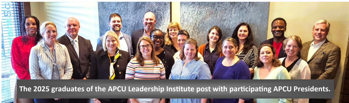
The 2025 graduates of the APCU Leadership Institute post with participating APCU Presidents.